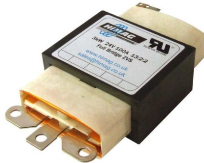
Typical E64 Planar Transformer (length max. 118mm, width max. 64mm, height max. 30mm)